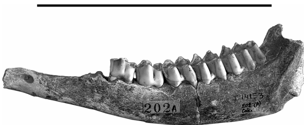
Fig 4 - I14153 - Capreolus capreolus Linnaeus. Incomplete left mandible (P 3 , P 4 , M 1 , M 2 , M 3 ); lateral view. The scale is 10 cm.