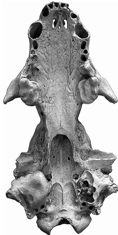
Fig 2 - I14280 - Meles meles Linnaeus. Incomplete cranium. The jaws retain the right M^1 and the left P^4 and M^1 ; ventral view. The scale is 10 cm.

I14280 - incomplete cranium. The jaws retain the right M^1 and the left P^4 and M^1 (Fig. 2); I14281 - incomplete left jaw ( P^4 , M^1 ); I14285 - incomplete right mandible ( P_4 , M_1 ); I14286 - incomplete right humerus (the distal epiphysis and 3/4 of the diaphysis is preserved); I14294 - fragmental axis; I14295 - incomplete right tibia (proximal epiphysis and 1/2 of the diaphysis).