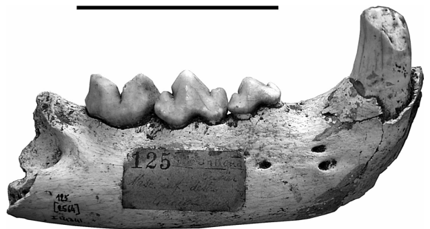
Fig 3- I14341 - Panthera pardus Linnaeus. Incomplete right mandible (C, P 3 , P 4 , M 1 ); lateral view. The scale is 5 cm.

I14091 - complete first phalanx (11 specimens); I14095 - incomplete right P 2 ; I14177 - complete axis; I14178 - incomplete left humerus (the proximal epiphysis and 1/2 of the diaphysis is preserved); I14179 - incomplete cervical vertebra (2 specimens); I14180 - complete cervical vertebra (5 specimens); I14182 - incomplete thoracic vertebra (7 specimens); I14183 - incomplete cervical vertebra (5 specimens); I14184 - incomplete lumbar vertebra (2 specimens); I14185 - incomplete left scapula; I14186 - incomplete right humerus (distal