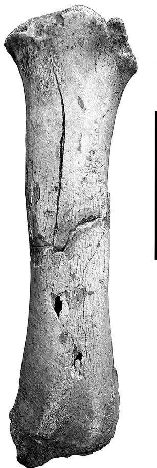
Fig. 5 - I14311 - Bos primigenius Bojanus. Complete left radius; anterior view. The scale is 10 cm.

bone; I14304 - incomplete right humerus (distal epiphysis and 1/4 of the diaphysis); I14305 - incomplete left calcaneus; I14306 - incomplete right tibia (distal epiphysis and 1/4 of the diaphysis); I14307 - incomplete left tibia (distal epiphysis and 1/4 of the diaphysis); I14308 - incomplete left tibia (distal epiphysis and 1/2 of the diaphysis); I14309 - incomplete right radius (proximal epiphysis and 1/4 of the diaphysis); I14310 - incomplete left radius (proximal epiphysis and 1/4 of the diaphysis); I14311 - complete left radius (Fig. 5); I14312 - incomplete right calcaneus; I14313 - incomplete right calcaneus; I14314 - incomplete left calcaneus; I14315 - incomplete left tibia (3/4 of the diaphysis); I14316 - incomplete right tibia (3/4 of the diaphysis); I14317 - complete left IV carpal bone; I14318 - complete left central + IV tarsal bone; I14319 - incomplete